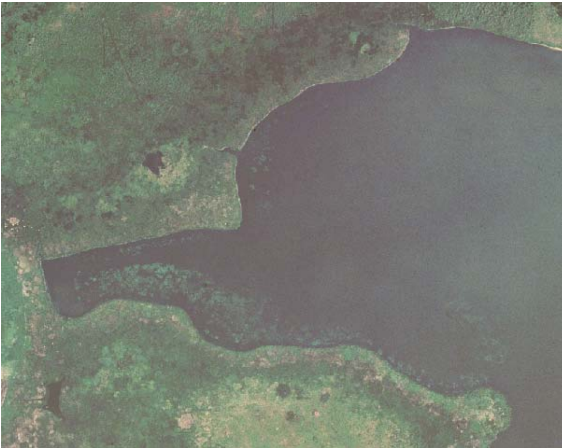
2005 – Haystack Bay