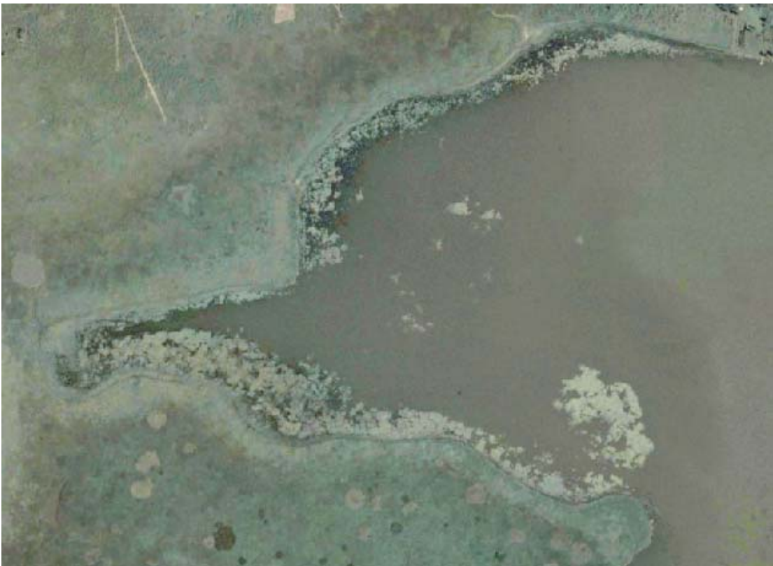
2006 – Haystack Bay